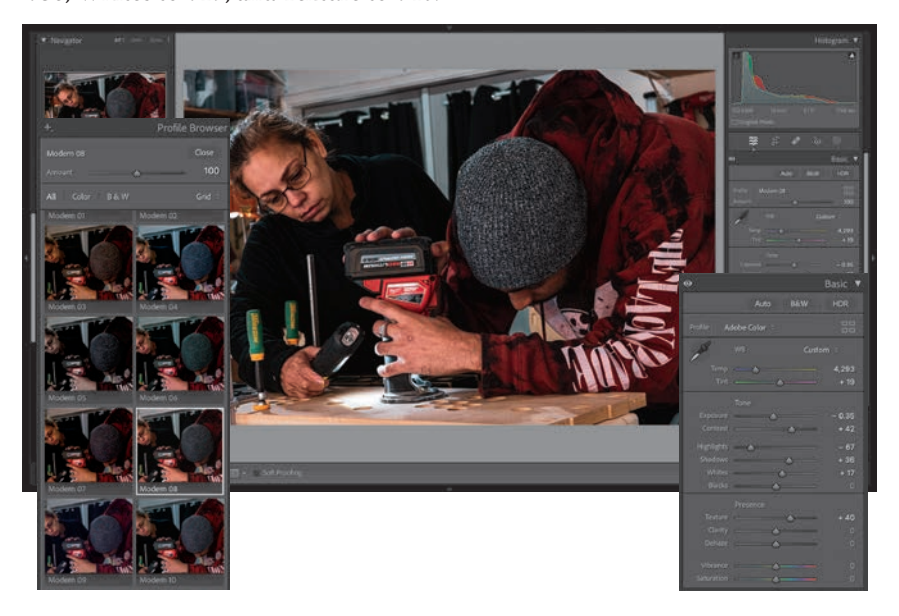
Tint to +19, Exposure to -0.35, Contrast to +42, Highlights to -67, Shadows to +36, Whites to +17, and Texture to +40.

2 Click the plus sign (+) icon at the right side of the Preset panel's header and choose Create Preset to bring up a dialog box that allows you to save specific settings for the toning of your images. Type Arcade Weekend as your preset name, click Check All, and then click Create.